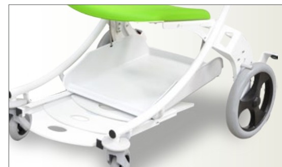
Sliding and self-blocking foot rest