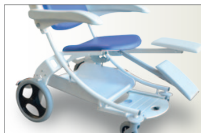
Two positions leg rest (optional)