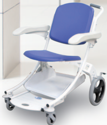
Patient transport chair I-MOVE For the patients' reception