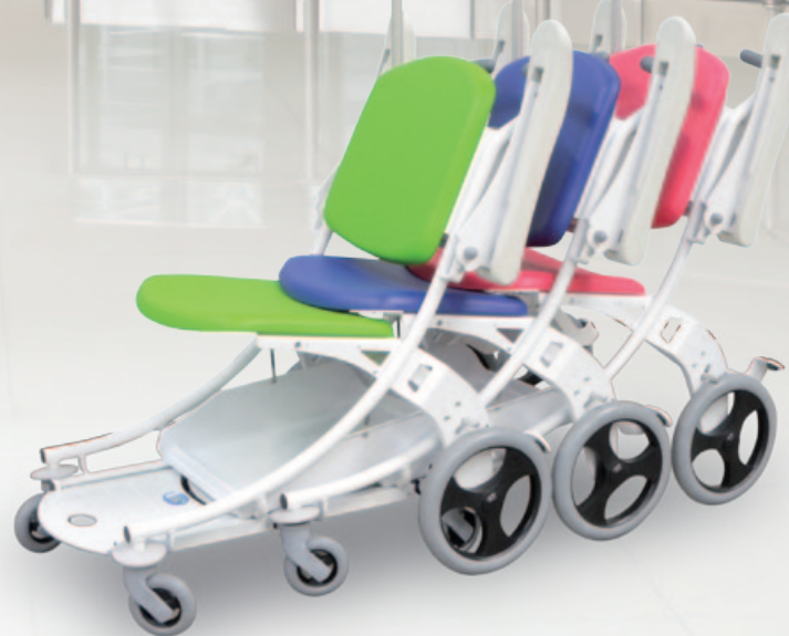
Stackable patient transport chair I-MOVE for optimized tidying